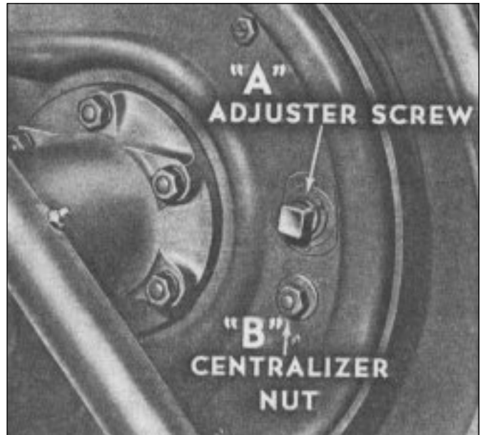
Fig. 2. Brake adjuster on TE/TEA-20 series models

For TO-35/F-40, lock the brake pedals together (for earlier models use the master brake) and test by driving the